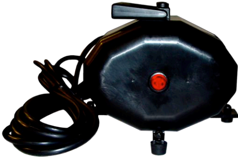
FIGURE 4 – BLOWER CONTROL

The on/off toggle switch is located on the end of the blower body.