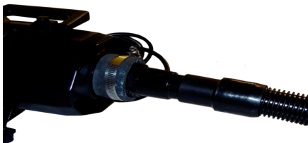
FIGURE 2 – INSTALL HOSE TO ADAPTER

Press fit end of hose over the adapter. Fit should be very snug.